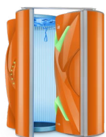
Xtreme Orange Metallic