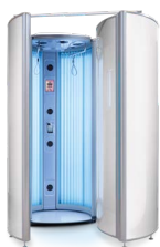
Dream White Metallic