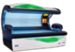
Charcoal Grey Matte