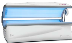
Dream White Metallic