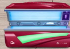
Fancy Red Metallic