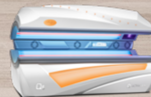
Dream White Metallic