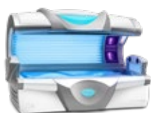
Dream White Metallic